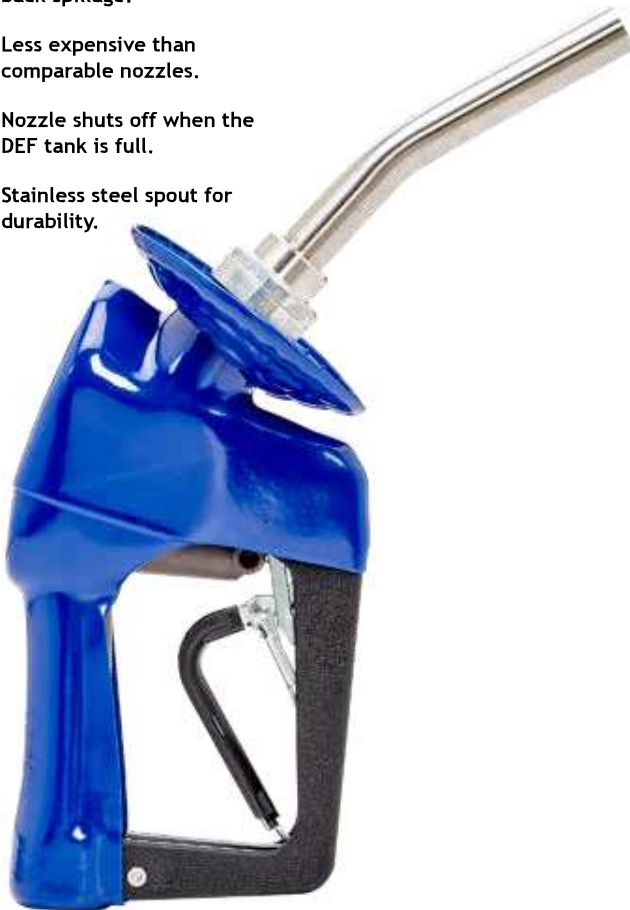
X DEF Plastic Nozzle Back Pressure Performance