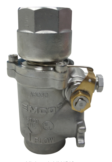
■ UL Listed MH6518 ATEX FTZU 14 ATEX 0204

The Emco Wheaton A0060 Emergency Shear Valve incorporates a replaceable shear section and a heat sensitive fusible link assembly. The valve can be manually operated to facilitate dispenser maintenance and incorporates a ^{3}/_{8} " test port. The closing poppet assembly is positioned out of the fuel flow path to minimize pressure drop. The A0060 utilizes a standard three boss mounting arrangement. Available in single or double poppet variants. Cast iron versions are powder coated.